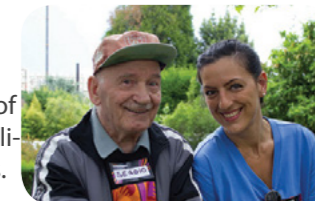
European Seniorforce Day Harnessing the Power of Senior Volunteers, 1 October

CEV advocates for age-friendly environments and the role of volunteering in fostering solidarity between generations. CEV was represented at opening conference of the European Year of Active Ageing and Solidarity between Generations, by The National Knowledge & Development Centre of Volunteering in Denmark.