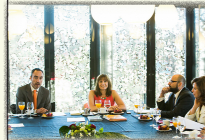
EVEN Roundtable at "la Caixa" Forum in Madrid