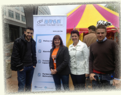
@European Citizens Picnic