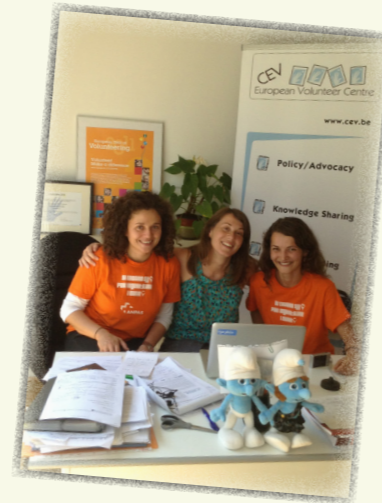
@Radio ANPAS- live from CEV office

The CEV Secretariat is located at the heart of the "European district" in Brussels and co-ordinates CEV's activities by: