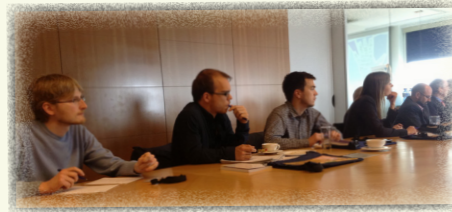
@EVEN Roundtable in Brussels