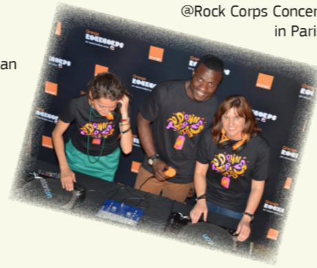
@Rock Corps Concert in Paris