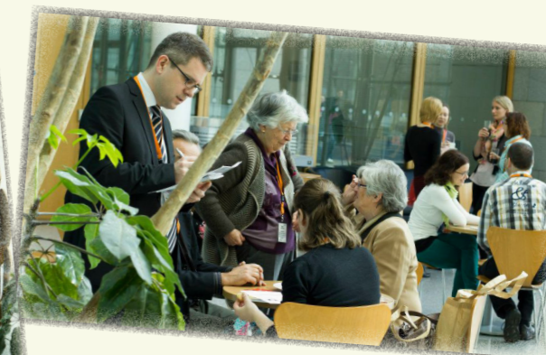
Capacity Building Conference: "Making things EVEN"