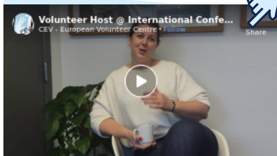
Volunteer Host, International Conference #EVCapital 2018