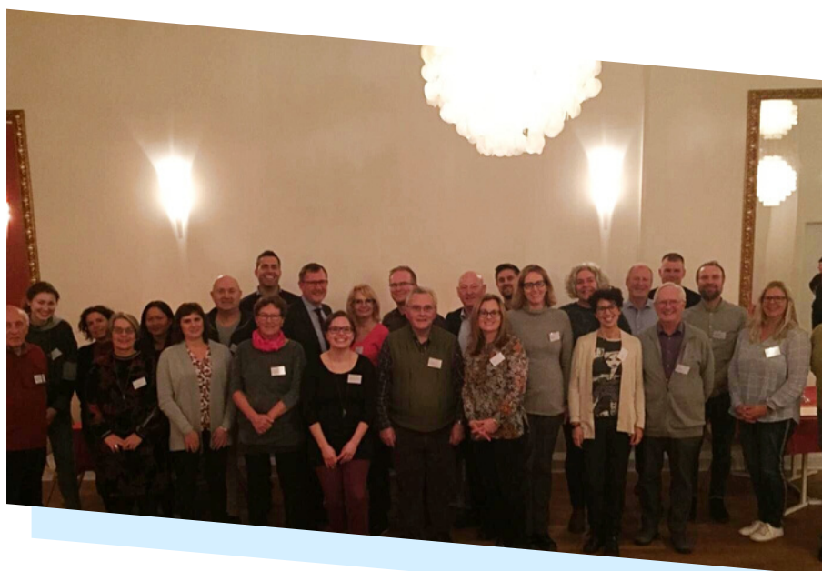
European Volunteering Capital Candidate Community The EVCCC attending the Study Visit