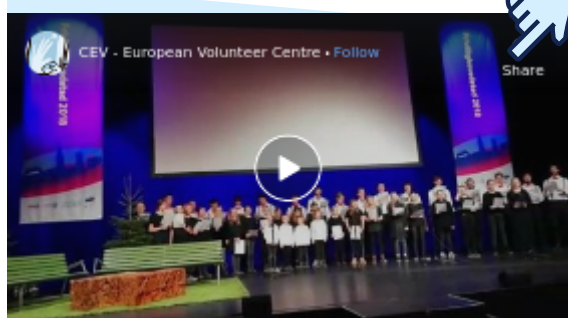
Volunteer Host, International Conference #EVCapital 2018